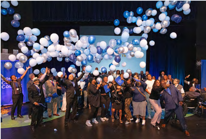
Balloons rain down on the inaugural Hall of Fame class