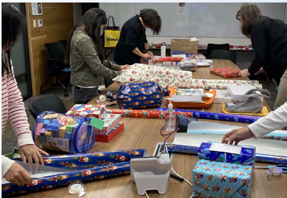
District Office employees wrap gifts