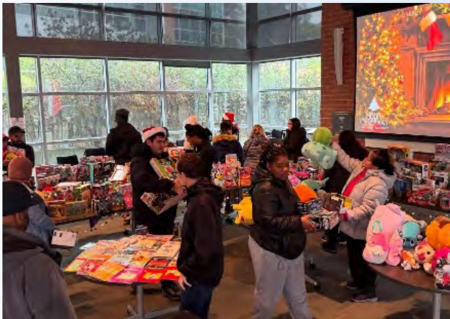
Contra Costa College Toy Drive

LMC capped off the season of giving by hosting its 34th annual Holiday Gift Drive, providing gifts to children of student families in programs such as EOPS, CalWORKS, and CARE.